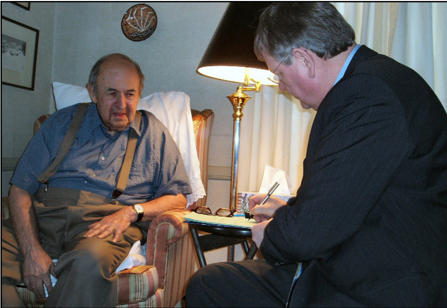
Gov Dave signs into law the legislation creating the Hathaway Scholarship Program while former Governor Stan Hathaway looks on.